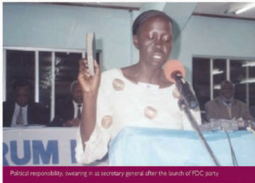
Political responsibility, swearing in as secretary general after the launch of FDC party

his admirable courage to confront the leadership he had belonged to 37 . We therefore went to South Africa and that is the first time I had a close discussion with Dr Besigye. He pledged that he would come back and offer leadership. When he came back, we held the first delegates conference and formally adopted and structured the party.