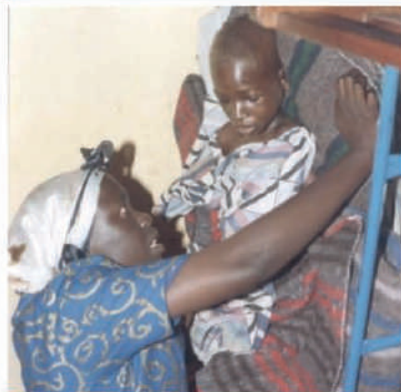
Comprehending the suffering of children in the North during select committee visit 2003, LRA insurgency.