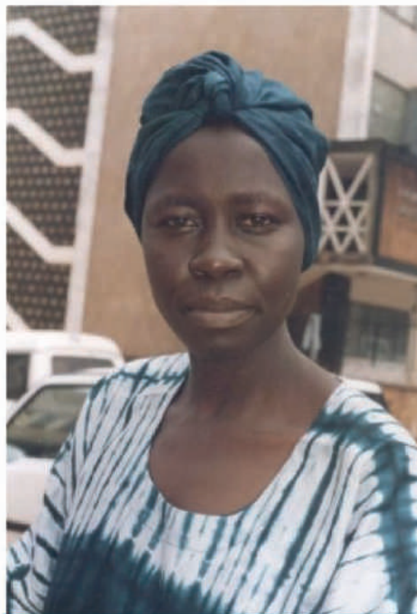
Young legislator 2003

“PAFO merged with Reform Agenda in 2004, Besigye had already fled the country to South Africa and we had to line up alternative potential names for leadership. A substantial number of people in Reform Agenda also expressed support for Dr Besigye despite other names that had been presented. At the time, he was a favourite of many; especially because of