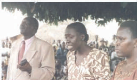
Chairperson select committee on internal displacement in the North & East addresses internally displaced people.