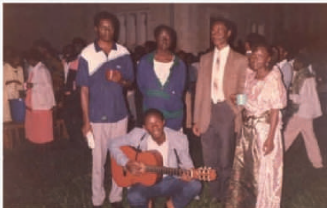
Growing in salvation MUK christain fellowship